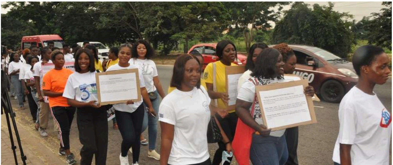
Students During the Disability Awareness Walk

These upgrades are part of the University's effort to modernise educational infrastructure, with the Vice-Chancellor highlighting the significance of such innovations in bridging traditional and digital learning. The initiative aligns with UG's strategic plan to improve student experience across its campuses. Read more here .